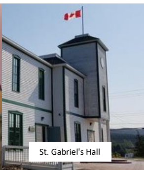
St. Gabriel's Hall