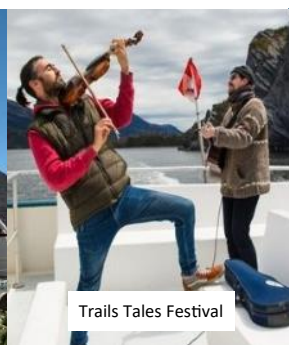
Trails Tales Festival