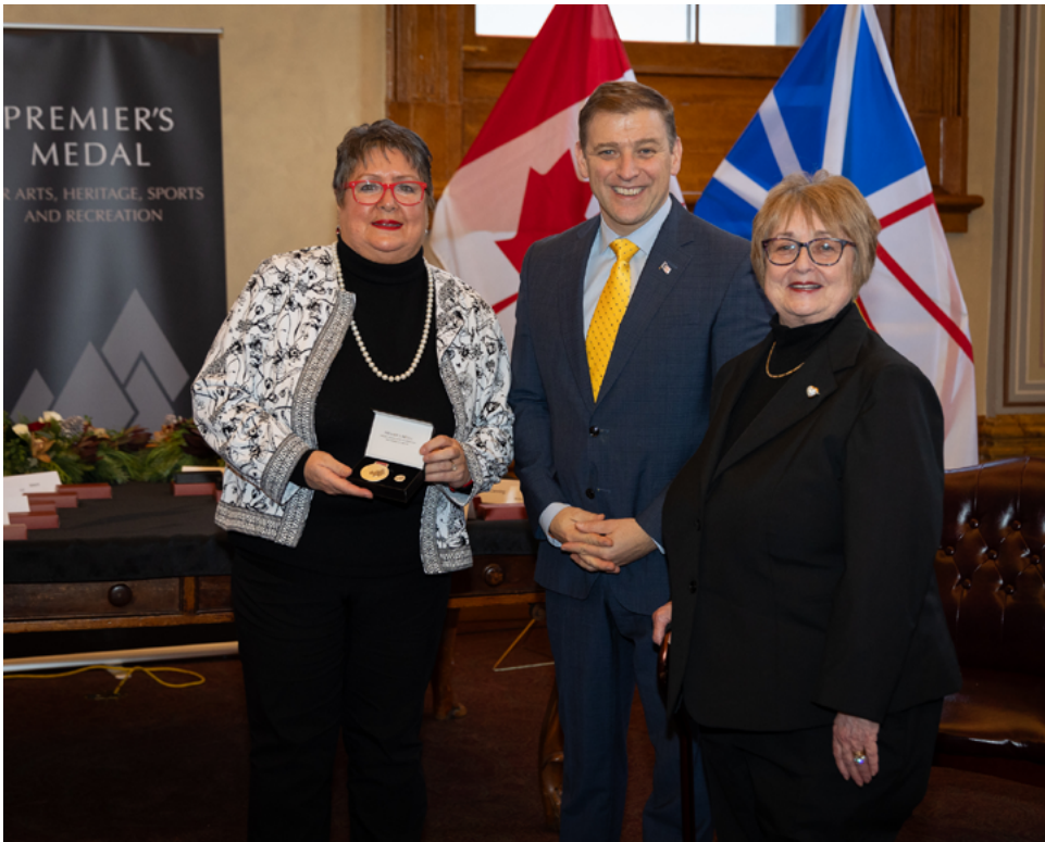
Honourable Dr. Andrew Furey presents the Inaugural Premier's Medal for Heritage to MANL.

On Monday, December 9, 2024, the Museum Association of Newfoundland and Labrador was honored to accept the Inaugural Premier's Medal for Heritage, presented by the Honourable Dr. Andrew Furey at the Colonial Building in St. John's.