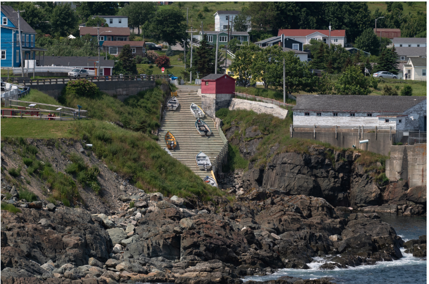
Pouch Cove.

To stay up to date on the events planned for 2025 to mark "Water Witch: A Century and a Half" please visit: https://www.pouchcoveheritage.com/ and https://cupidslegacycentre.ca/