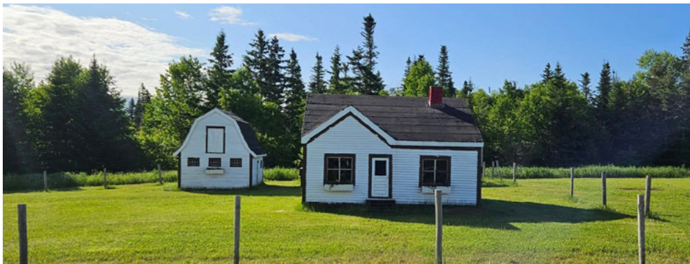
A replica house in the Town Centre.

From swords to plowshares, Cormack's story is not simply the story of a farming community — it is the story of resilience, sacrifice, and determination born out of war and built through hope.