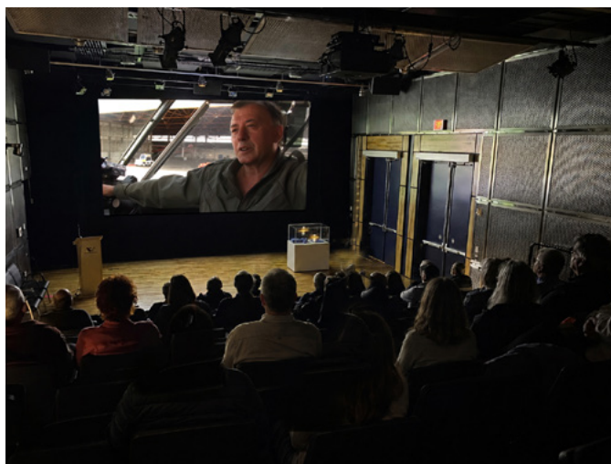
The audience gathers at The Rooms theatre for the screening.