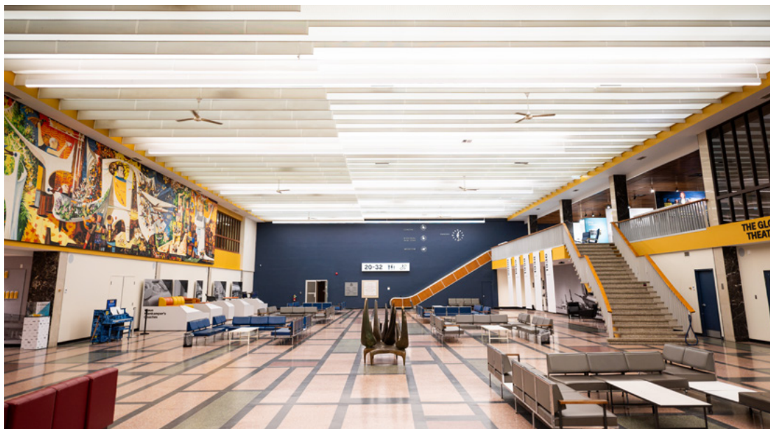
Gander, NL: The iconic mid-century-modern Gander Airport International Lounge has received provincial designation as a Registered Heritage Structure.

The Gander Airport International Lounge was constructed in 1958 and opened in 1959. The lounge is an example of mid-century modern architecture and the “Jet Age” style. It was designed by Canadian architect John M. Lyle & Associates, with contributions by C.B. McNeil, the then chief architect for the Department of Transport.