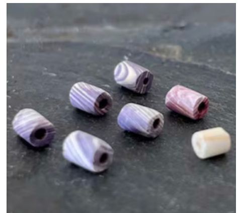
Wampum beads.