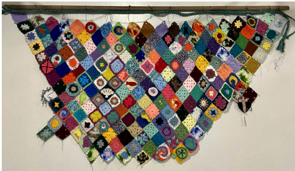
The finished tapestry.

Heritage and culture were the driving forces for how the final net tapestry took shape. It reveals the inseparability between change and heritage and culture. Individual voices are expressed through colourful squares that make the whole mosaic of transformation. Engaging with the net through these deep connections represents the inseparability between the self and sustainability.