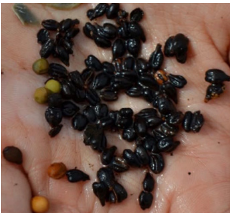
Charred grape seeds.